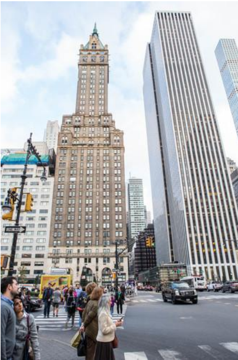
The Sherry-Netherland Hotel in Manhattan.

With the flight preparing to board and FBI agents taking positions on the jet bridge, White House national security officials convened a conference call with participants from the State and Justice Departments, the Pentagon and the intelligence community.